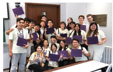
Photos of 2024 Summer School